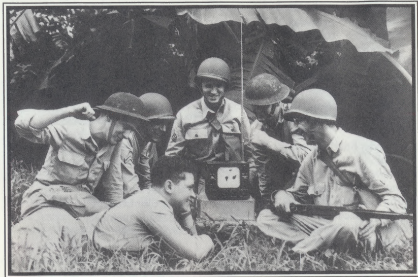
The roar of the 1942 World Series is heard in the tropical forests of Panama courtesy of the Office of War Information.

I Can't Give You Anything but Love 1 Lena Horne with Charlie Spivak's Orchestra (McHugh-Fields)